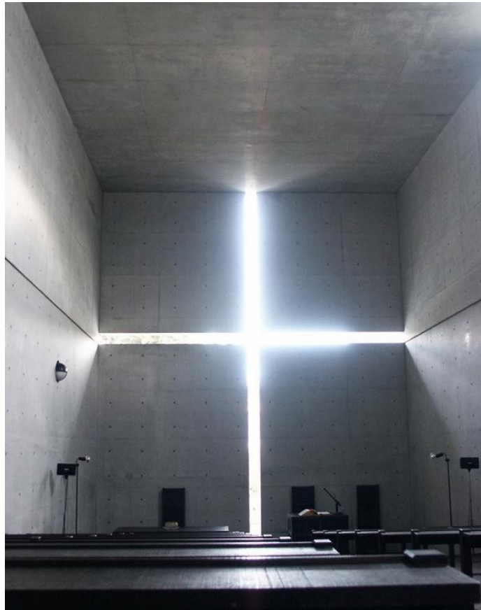
Church of the Light, Ibaraki, Japan.

Cover Art is Sculpture of Moses' bronze snake on Mt. Nebo.